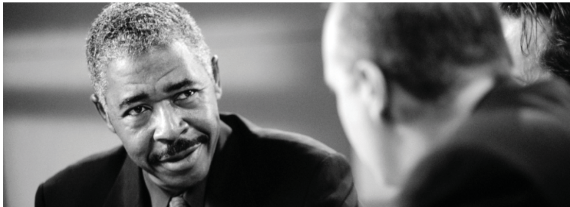
Leverage the power of Sunflower Enterprise to manage asset loans with Sunflower Sentry.

Asset Check-in and Check-out Classifications. Sunflower Sentry enables